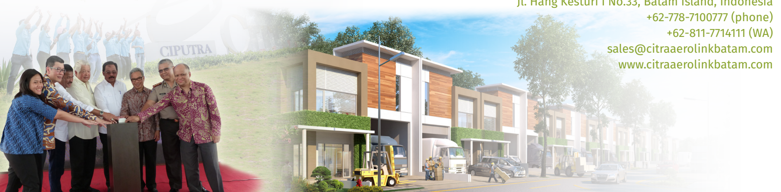
Groundbreaking ceremony of Citra Aerolink Batam was held on 26th October 2017 at KIIE.

Kabil Integrated Industrial Estate (KIIE) Jl. Hang Kesturi I No.33, Batam Island, Indonesia +62-778-7100777 (phone) +62-811-7714111 (WA) sales@citraaerolinkbatam.com www.citraaerolinkbatam.com