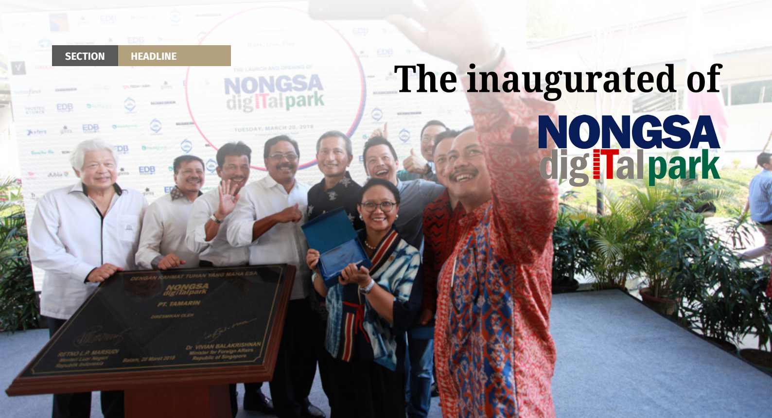
The inaugurated of Nongsa Digital Park by Minister of Foreign Affairs of Indonesia, Mrs. Retno Marsudi and Minister for Foreign Affairs of Singapore, Mr. Vivian Balakrishnan, on 20 March 2018.

Nongsa Digital Park (NDP) is designated to be one of the main digital economy gateways in Indonesia, located in Indonesia's Batam island next to Nongsa Ferry Terminal, 35 minutes from Singapore's Tanah Merah Ferry Terminal. NDP has an ideal infrastructure for digital businesses to grow and it incorporates plans for a future data centre, complete with lifestyle and tourist facilities within the existing Nongsa Resort enclave.